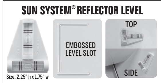
Attach the triangle reflector level into one of the embossed level slots located on the top or side of the reflector as shown.