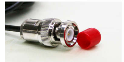
Rubber Protector Removed