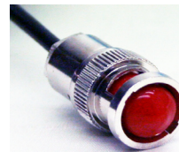
Rubber Protector On